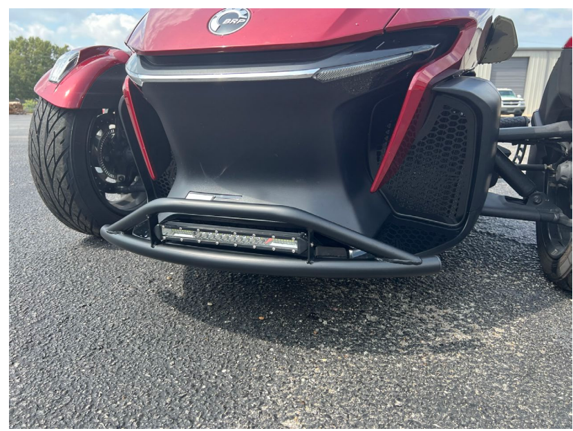
Shown with Optional LED Driving Light SRT20+DLB