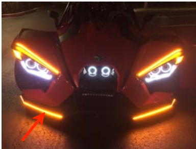
Lower valance dual color LED's

See our other visual safety lineup coming soon Exclusively from Slingmods and TricLED.com