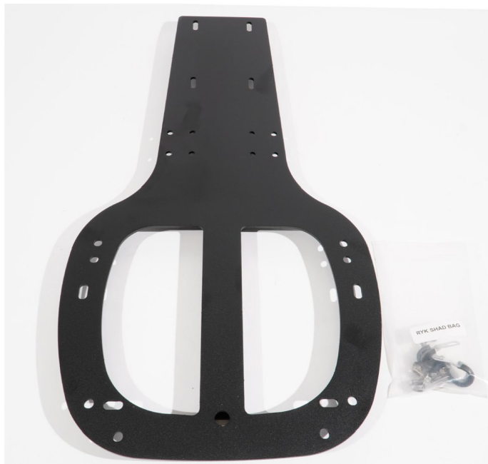
Complete Kit shown above.

DO NOT USE IMPACT DRILL ON BOLTS OR NUTS.