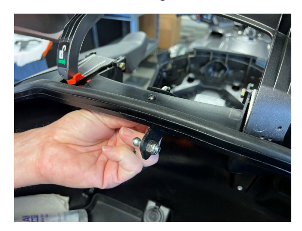
4.-Take the trunk lid and tilt forward to the front of the Spyder so it's easier to work on. Using the supplied template drill each side a 7/32" hole. Simply turn the template over to drill the opposite side.

3.-Next take the supplied T-20 Screws and Locknuts and secure the upper mount bracket as shown below. Tighten down both nuts using a 10mm wrench.