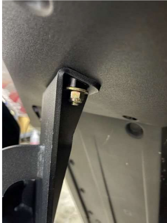
4.- Left & Right-side mounts installed.

4.- Next take the left mount and place it as shown below. Use the supplied spacers between the mount, washer and locknut. The spacer keeps the locknut aligned correctly with the panel and bolt. Do this on the bolts on the left & right-side mounts. Tighten down all locknuts