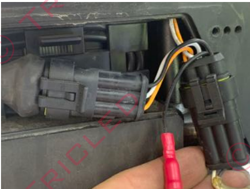
Showing: 3 pin OEM harness that we will be plugging into with the supplied harness.