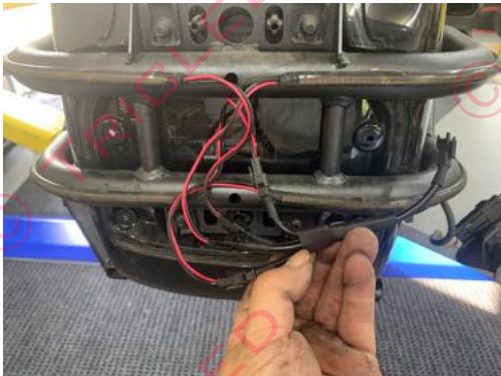
Connect all 4 strips to the 1:4 splitter