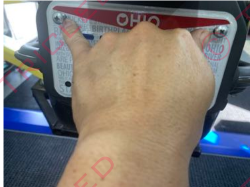
Remove license plate.