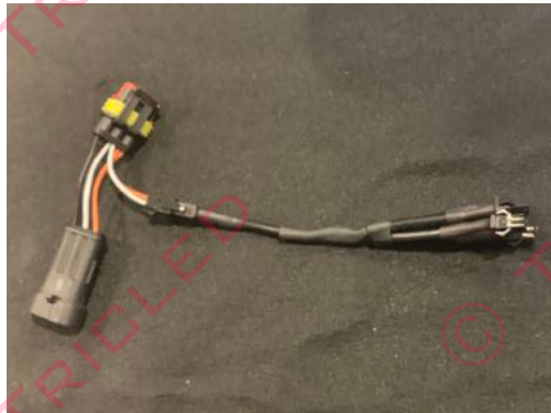
Connect 1:4 splitter to OEM 3 pin harness provided and connect it to rear fender 3-pin harness inline.