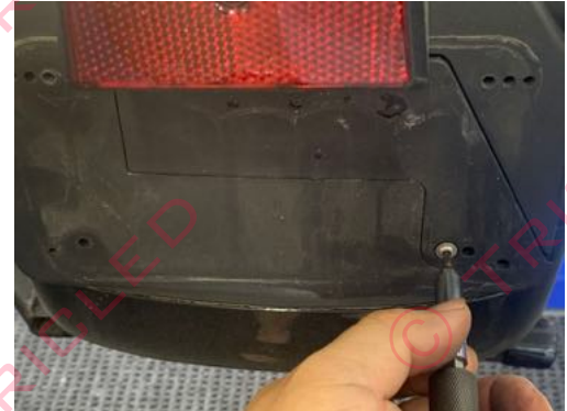
Using a Torx10 bit, remove screw to open the rear covering to reveal the 3 pin OEM harness.