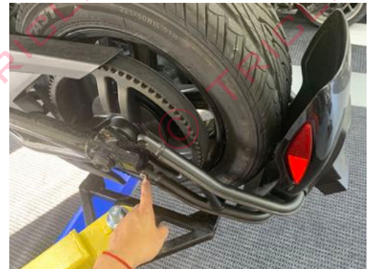
Once all 4 bolts are removed, swing out the fender to the right to reveal the inner back of the fender. Wires will be attached to right side.