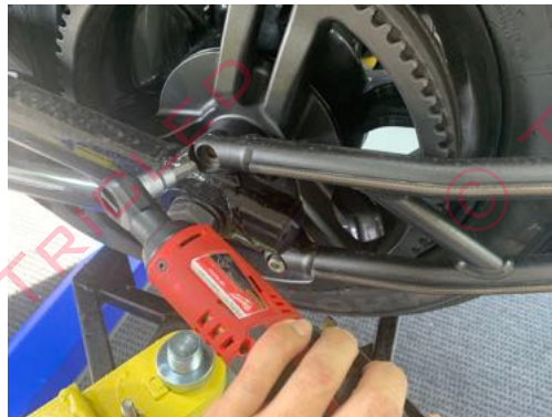
Loosen and remove 4 bolts that hold the fender bracket.