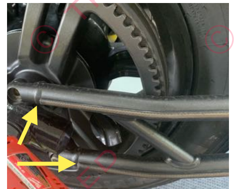
Start by using the longest strip on each side of the top bar. Then short strip on lower bar (See above). All wires exit to the center of the fender. Don't stretch the LED strips.