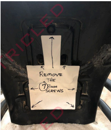
Using 8mm socket, remove these 7 screws and remove the outer plastic license plate cover.