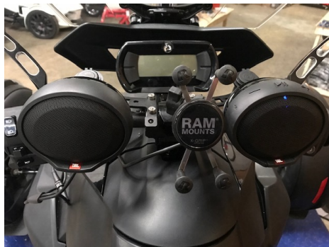
Shown with Optional Ram Mount Phone Holder.

7.- The JBL Speakers, Run the power wires direct to the Battery as per instructions. The speakers have an auto shutoff when a single is no longer.