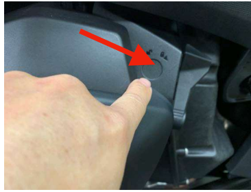
Locate the panel with this graphic on the left side.