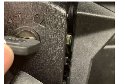
Test the lock, move the lever slightly to line up the lock until you're able to turn the key fully to the right. When lock is engaged it will prevent the lever to be unlocked.