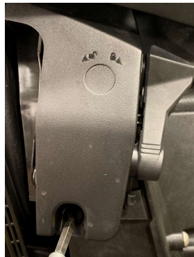
Use a torx 30 and remove bolt from bottom of lock cover.