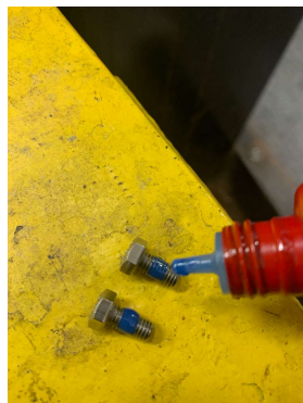
Apply loctite to the two mounting bolts.