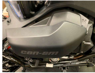
Remove the air box outer cover.