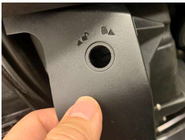
Drilled key slot.