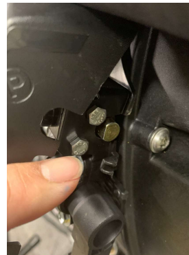
Insert the lock with key hole facing out and tighten the two bolts to the lock using 8mm socket.