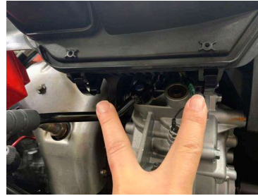
Locate the two snap lock below the air box.