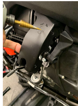
Lift cover from the bottom slightly and drill approximately a 1/2" hole for key opening.