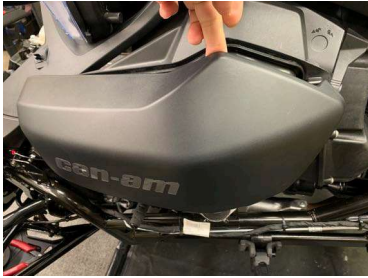
Pul cover from the top.