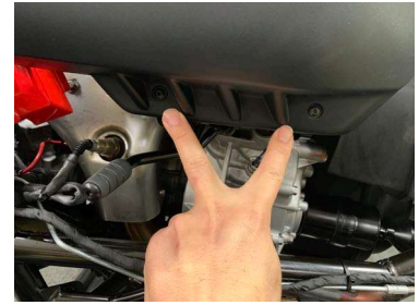
Use torx 20 to remove these 2 screws.