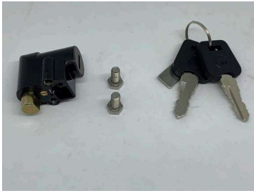
Contents Lock, 2 screws, 2 keys.