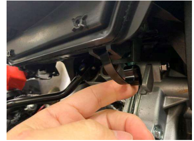
Push down to release both clips and remove cover.