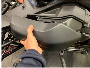
Slide cover forward to remove.