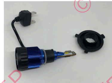
T2 LED light