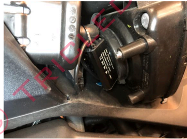
Zip tie any loose wire harness and tuck neatly behind the headlamp