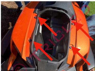
Remove 4 push pins under front cover, remove orange panel shown