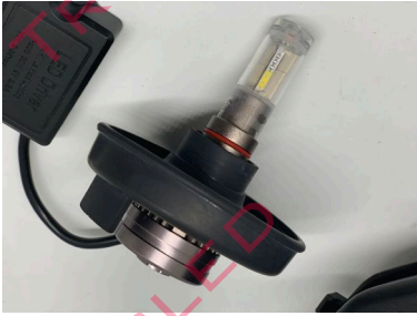
360 LED install

Slide the LED through the back of rubber boot