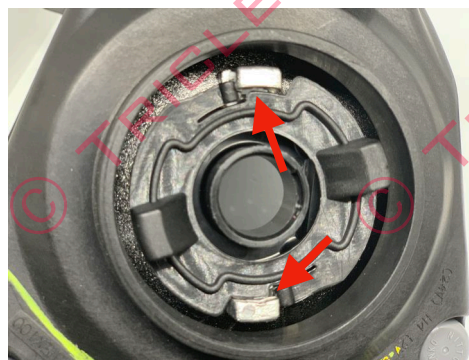
Place the new lock ring over the base into position. It is important that you push gently down on one side of the lock tab and turn clockwise. Once one side is in push and turn clockwise for other side of lock clip. Do not force twist the lock.