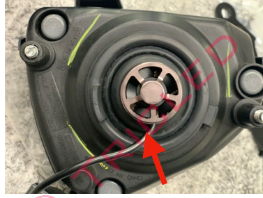
360 LED install

Slide the LED through the back of rubber boot