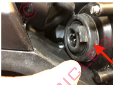
Remove rubber boot cover