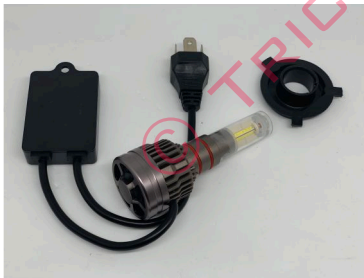
360 LED headlight or