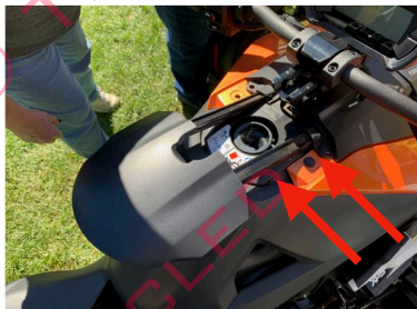
Move gas tank cover back and remove the 2 push pins on each side

Please refer to pg 126-128 in the owners manual for additional illustration and explanations