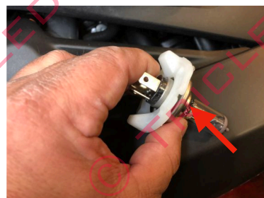
Remove factory headlight