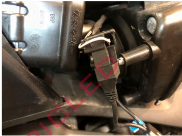
Connect OEM harness to LED

Position the wire to be at the 6 o'clock position for both left and right side.