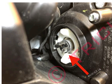
Remove white plastic base by turning it counter clockwise