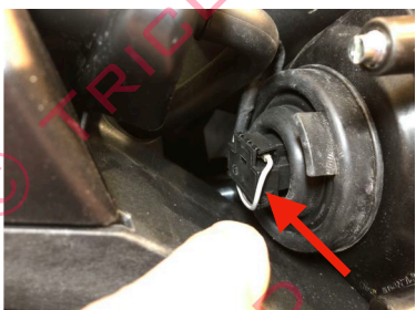
Remove headlight wire harness