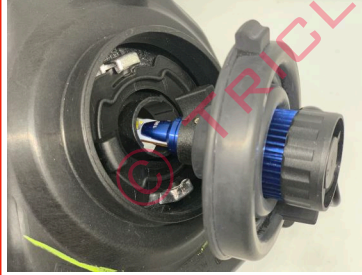
T2 LED model

Position the wire into the 6 o'clock position for both left and right side.