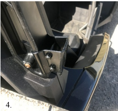
4. right side clamp bracket attached