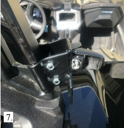
7. inside clamp bracket with lock