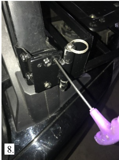
8. left side hinge bracket