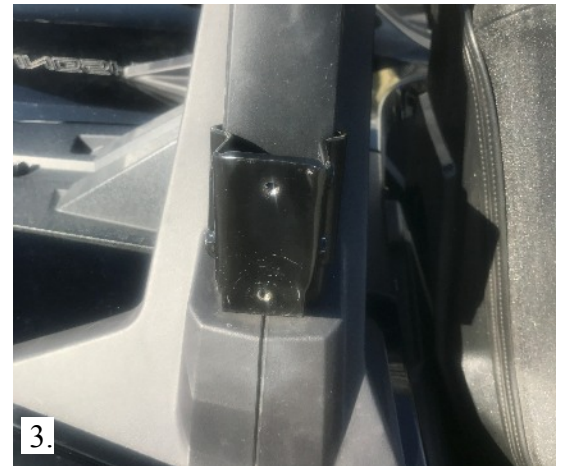
3. showing bracket in the correct position on hoop