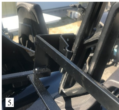
5. install rack with clamp bracket attached