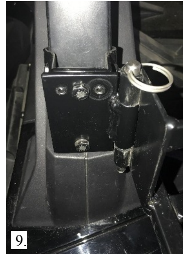
9. installed quick release pin