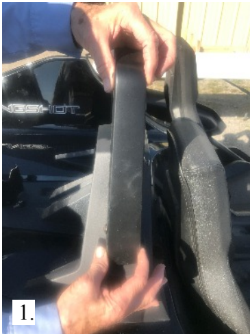
1. showing the tapered hoop