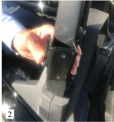
2. showing how to slide the bracket onto hoop