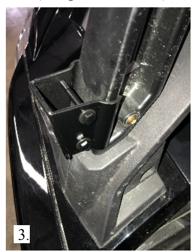
showing bracket in the correct position on hoop