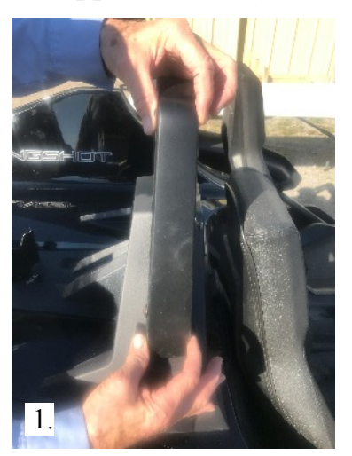
showing the tapered hoop