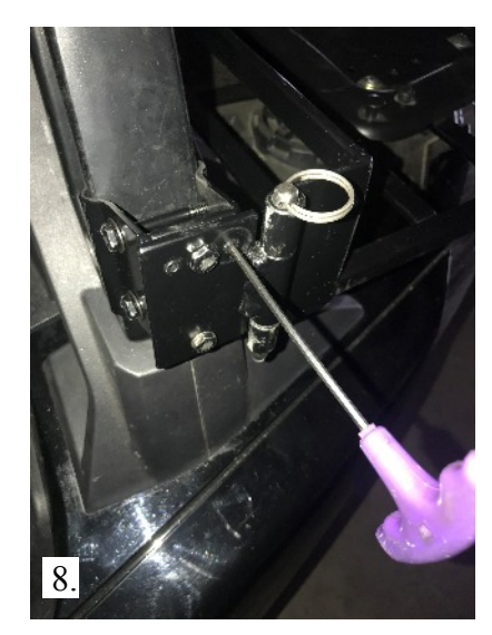
left side hinge bracket