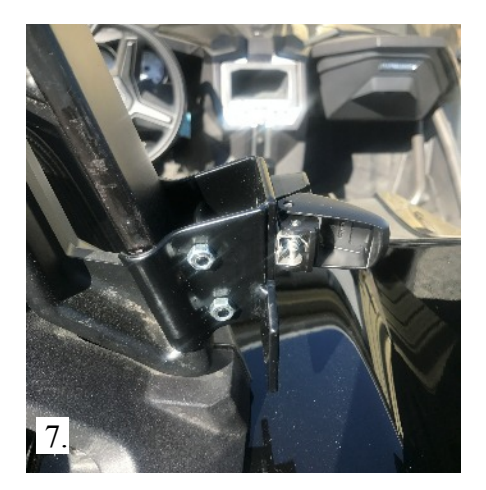
inside clamp bracket with lock