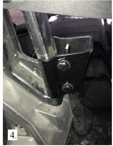
right side clamp bracket attached leave bolts loose