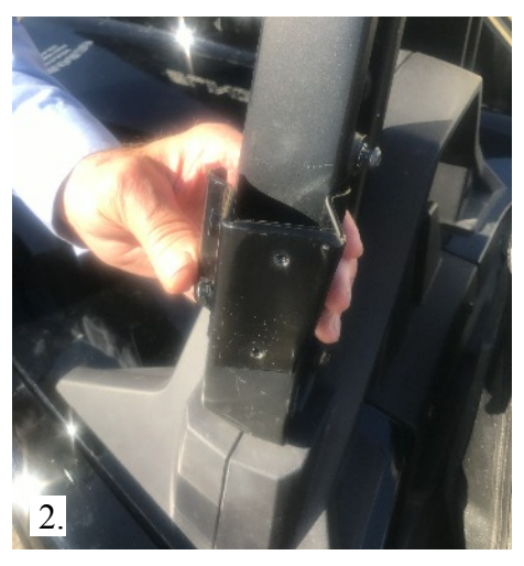
showing how to slide the bracket onto right side of hoop