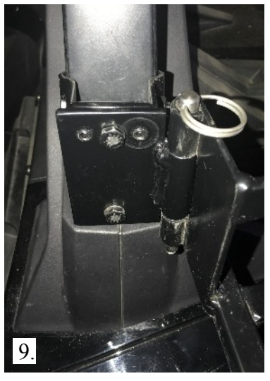
installed quick release pin