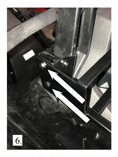
Installed 1/4-20 screws